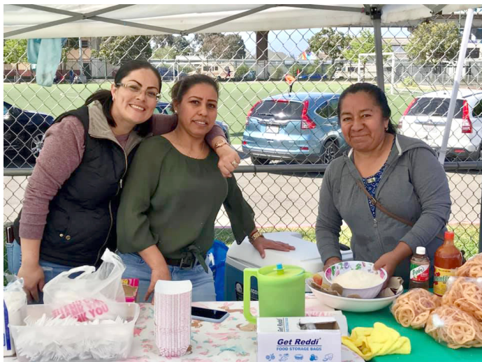
ICS parent leaders organize a fundraiser for a family in the community.