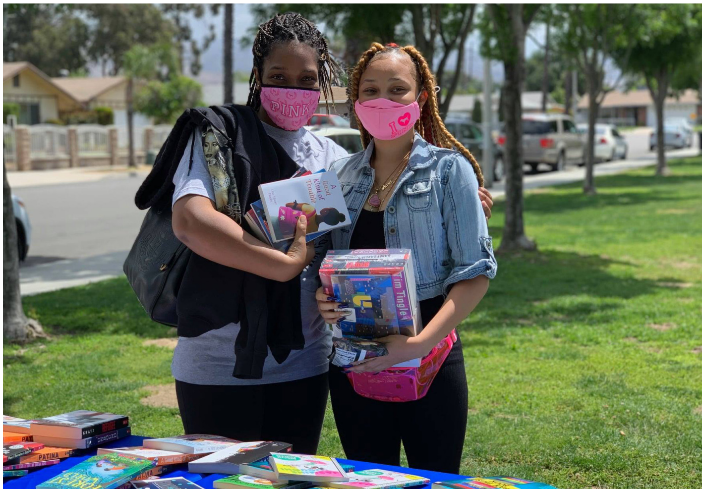
ICUC's Parents United for Change hosts a Books and Breakfast event to hand out new books and a meal to more than 140 families.