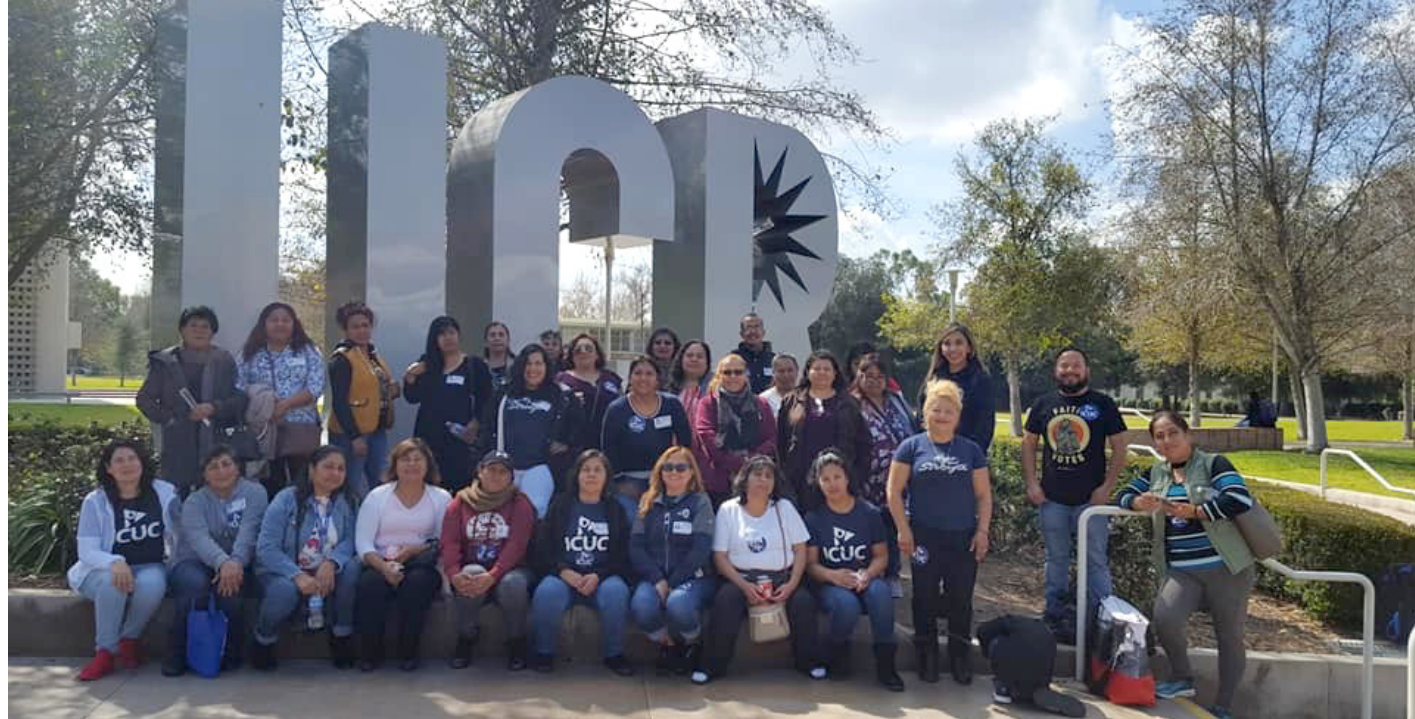
San Bernardino families tour UC Riverside, an activity made possible thanks to parent organizing.

with ICUC to pay stipends to parent organizers to engage families at school sites, in the community, and in their congregations.