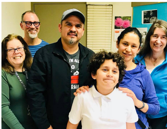
An ICS student with his family and teachers.