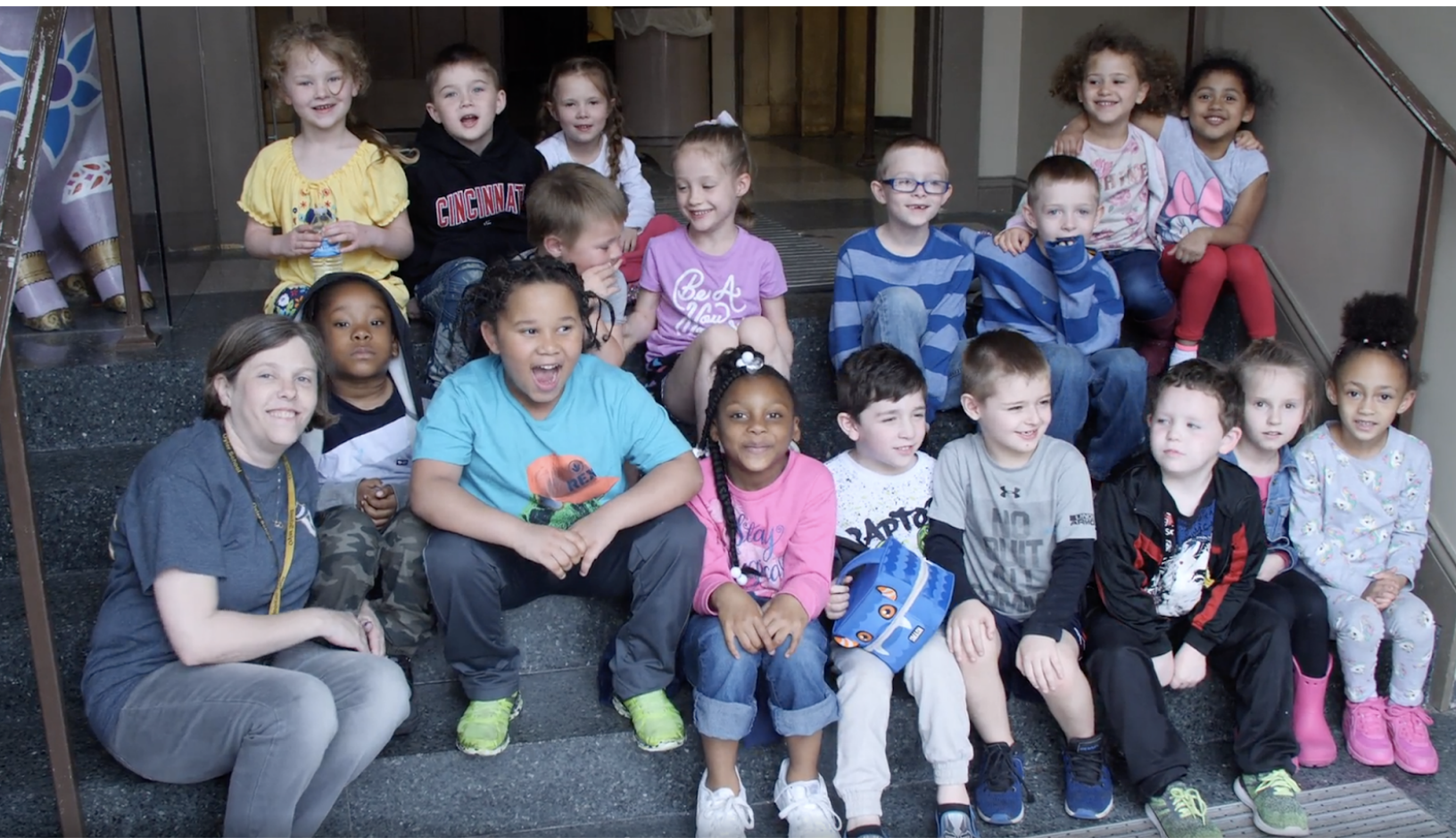
Still from On the Rise: Cincinnati's Community Learning Centers ; film produced by MediaSutra & the Partnership for the Future of Learning, 2020.