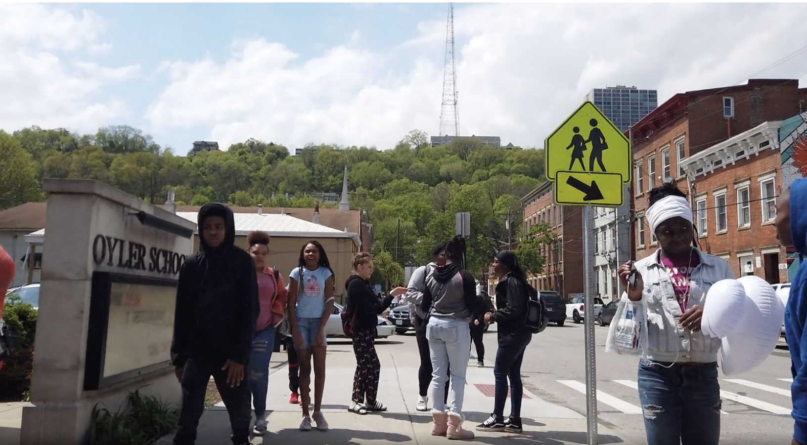
Still from On the Rise: Cincinnati's Community Learning Centers , film produced by MediaSutra & the Partnership for the Future of Learning, 2020.